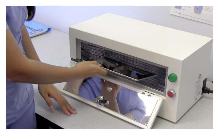
The UV Box's 55-second cycle time fits within the World Health Organization's guidelines on hand washing duration, meaning hand hygiene and device disinfection can happen simultaneously.

That speed means The UV Box will fit into your hospital workflows, allowing for frequent, consistent device disinfection throughout the day, across multiple departments.